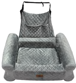
Dog Car Seat Body x1