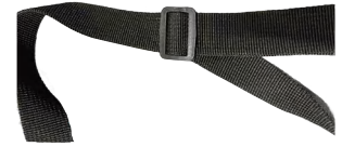
Adjustable Buckle x3