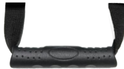
Safety Fixed Handle x1