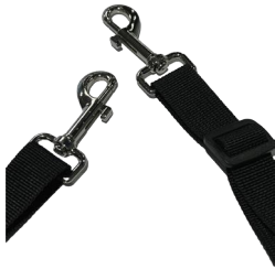
Pet Safety Leash x2